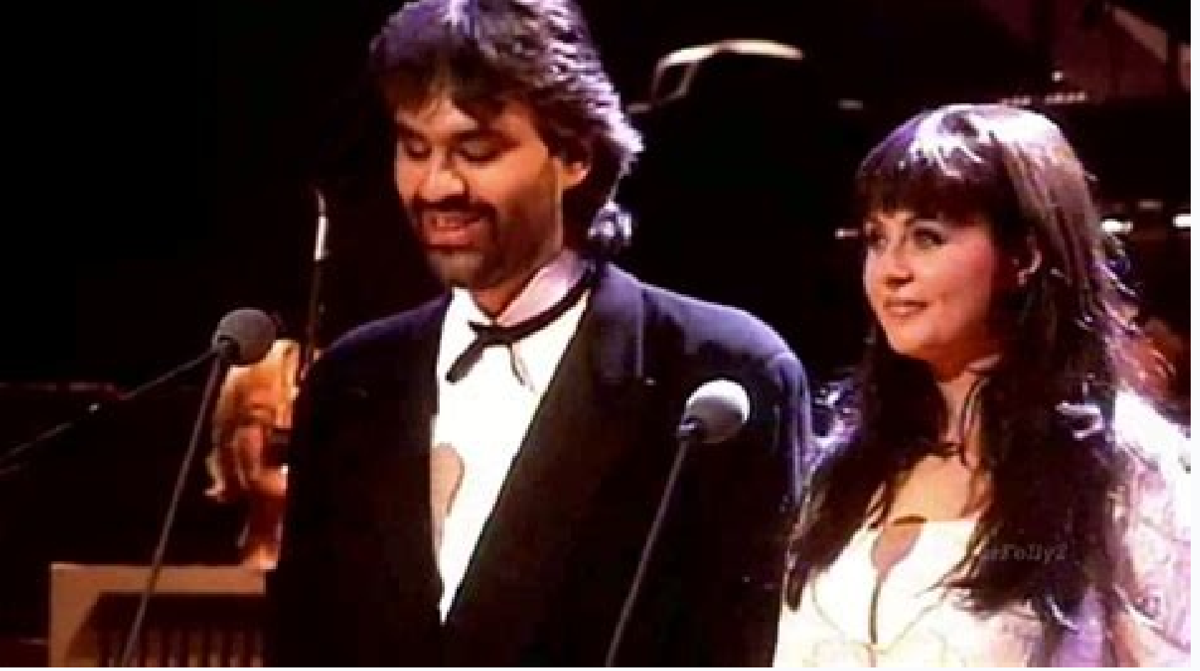
Sarah brightman time to say goodbye lyrics english. Sarah brightman time to say goodbye english version lyrics. Sarah brightman time to say goodbye english. Sarah brightman time to say goodbye lyrics meaning. Sarah brightman time to say goodbye cd. Sarah brightman time to say goodbye album. Sarah brightman time to say goodbye other recordings of this song, Sarah brightman time to say goodbye lyrics.